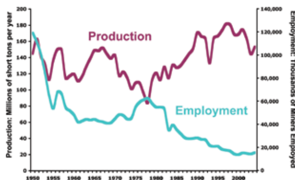
Coal Production and Employment in West Virginia, 1950-2005

M ountaintop removal coal mining is as destructive to our economy as it is to our mountains. Appalachia has put blood, sweat, and tears into providing America with billions of dollars worth of coal, and yet, after 150 years of mining, the promise of prosperity remains empty. There were once over 150,000 miners in West Virginia. That number is now below 20,000 and falling, and the Appalachian coalfields remain one of the most impoverished areas in the country. There was a time when coal was the economic backbone of the Appalachian region, but declining production and a new reliance on heavy machinery means a loss of traditional deep mining jobs once so important in the coal-bearing communities (Fig 1). Over 1 million acres of productive land have been destroyed by mountaintop removal, but less than 2% of that land is reused for economic development. A destroyed land, littered with mining machinery, surrounded by unstable earth and contaminated water resources gives little reason for industry to invest in Appalachia.